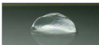
Biphasic HA 20mg/g

➔ A low hygroscopic activity : 15mg/g hyaluronic acid concentration level combined with a crosslinked process (a combination of crosslinked and non-crosslinked hyaluronic acid) produces a low-hygroscopic gel. This characteristic allows controlling the risk of swelling with very low risk of oedema (2) . The effect of the injection is immediately visible and enduring over time.