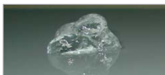
Monophasic HA 24mg/g

Redensity [II] Eyes has been developed thanks to an innovative production process resulting in a subtle balance between a 15mg/g concentration level of hyaluronic acid and a semi-crosslinking process (a combination of cross-linked* and non-crosslinked hyaluronic acid). This characteristic implies controlled risk of swelling with very low risk of oedema (2) .